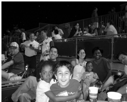
Beckett's Ridge Residents Enjoy the Durham Bulls Terrace Boxes

Cedar Ridge High School: August 7 5:00pm-7:00pm