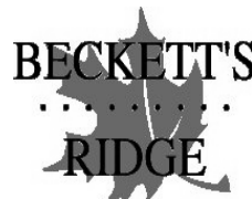
T-Shirt Front (pocket logo)